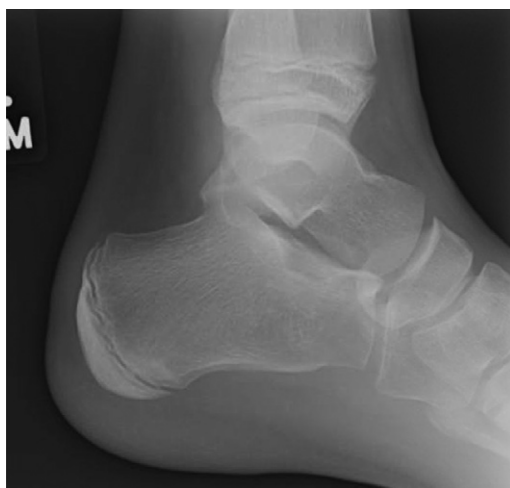
Fig. 7. Calcaneal apophysis.

Athletes present with pain in one or both heels, although bilateral involvement is typical. The most common age group affected is 10 to 12 years of age, with the condition being two to three times more common and occurring 1 to 2 years later in boys because of later skeletal maturity [42,45,49]. Pain is activity-related and reported to be along the heel or at the posterior aspect of the heel where the Achilles tendon inserts onto the apophysis. Patients will often limp or walk on toes to prevent painful walking. Examination reveals tenderness along the calcaneal apophysis, either medial or lateral, and can be elicited through medial and lateral compression of the calcaneus along the apophysis (Fig. 8).