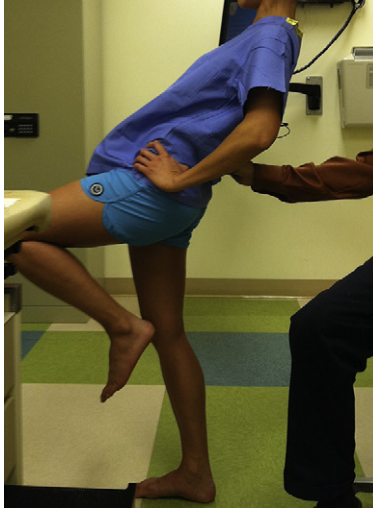
Fig. 11. Stork test.

Diagnostic workup should begin with plain radiographs, including antero-posterior and lateral views of the lumbar spine. Obtaining oblique views to look for the “Scotty dog” sign in the pediatric patient remains debatable because of the increase in radiation exposure and uncertainty regarding whether it improves diagnostic accuracy. In general, plain radiographs have been shown to have poor sensitivity in demonstrating pars defects [77] but can be helpful to assess for other gross bony abnormalities.