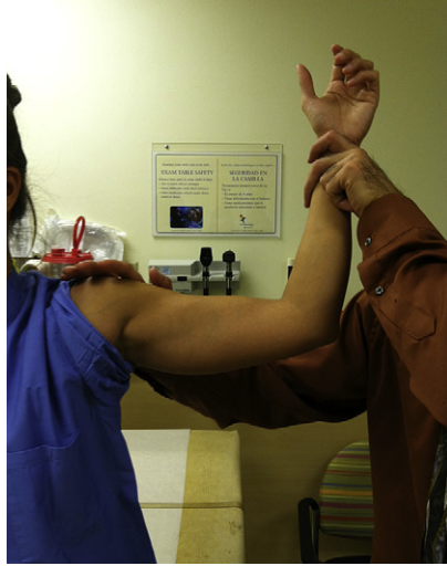
Fig. 2. Apprehension test.

Treatment of MDI without known associated labral or rotator cuff disease is usually conservative, with relative rest from offending activities and physical therapy. After an initial period of rest and antiinflammatories to improve pain, physical therapy should begin with strengthening exercises for the dynamic rotator cuff and scapular stabilizer muscles [9,15,17]. An endurance