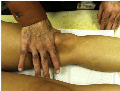
Fig. 9. Patellar grind test.

Functional deficiencies such as core and pelvic weakness, quadriceps and hamstring tightness, and IT band tightness should also be assessed. Radiographs are not necessary for diagnosing patellofemoral pain, but they can