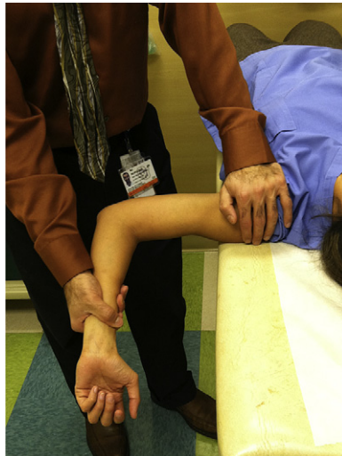
Fig. 3. Relocation test.

Treatment of MDI without known associated labral or rotator cuff disease is usually conservative, with relative rest from offending activities and physical therapy. After an initial period of rest and antiinflammatories to improve pain, physical therapy should begin with strengthening exercises for the dynamic rotator cuff and scapular stabilizer muscles [9,15,17]. An endurance