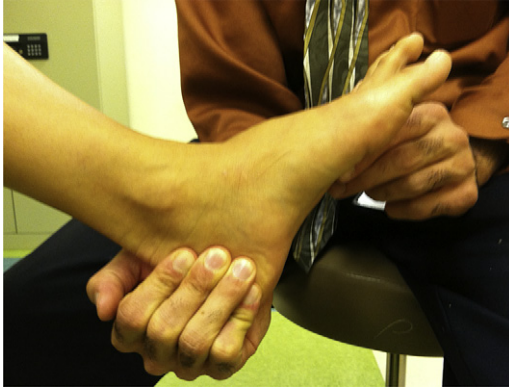
Fig. 8. Calcaneal squeeze test.

Tenderness can also be found at the Achilles insertion site on the calcaneus. Athletes will also often have tight calf muscles and Achilles tendon, with weakness on dorsiflexion because of pain. Radiographs typically appear normal or may reveal a fragmented hyperdense sclerotic apophysis [43,49]. Radiographs of the calcaneus are not necessary to confirm the diagnosis if the history and clinical findings are consistent, but can be obtained to rule out other bony disease. Studies have found that up to 5% of radiographs in patients with heel pain reveal pathologic conditions, making radiographic evaluation worthwhile even in light of a clear clinical picture for Sever disease [50].