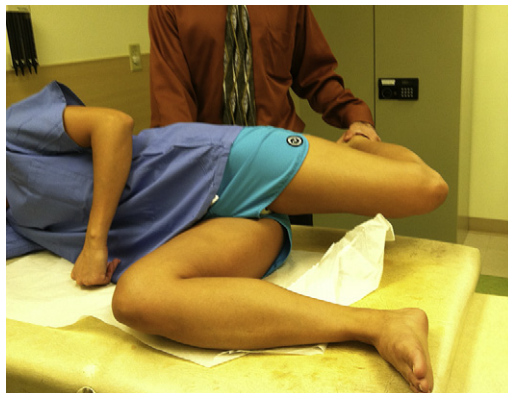
Fig. 10. Ober test.