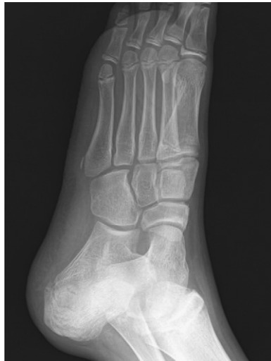
Fig. 6. Fifth metatarsal apophysis.

Treatment of Iselin disease is centered around activity modification, icing, antiinflammatories, and peroneal stretching and strengthening. For more symptomatic or recalcitrant cases, physical therapy should focus on ankle flexibility, particularly of the evertors and plantar-flexors; ankle strengthening; and proprioceptive exercises [41,43,45,47]. These exercises can improve dynamic ankle stabilization, which can minimize repetitive traction forces on the fifth metatarsal apophysis from ankle instability. With mild to moderate cases, symptoms typically improve with conservative treatment and one can anticipate return to play in 3 to 6 weeks. More severe cases may require an