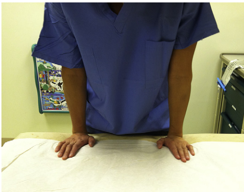
Fig. 4. Table push-off test.

The mainstay of treatment of gymnast's wrist involves rest from wrist-loading activities. Ice, antiinflammatories, and immobilization in a wrist brace as needed for pain control can be used. Physical therapy is usually helpful and a graded return to activity is essential. Physical therapy during the rest and rehabilitation phase should include focused assessment of limb alignment, laxity, strengthening, and proprioception [28,30]. A wrist brace or taping to reduce wrist